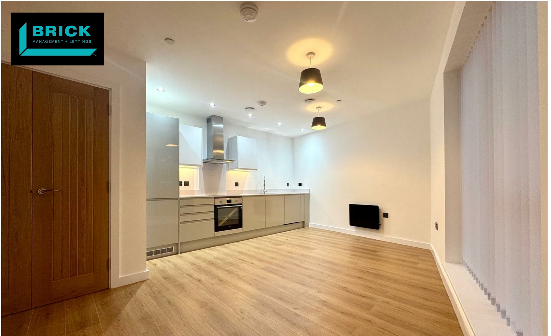
Apartment 26 23 Legge Lane, Birmingham, B1 3LX £950 Per month